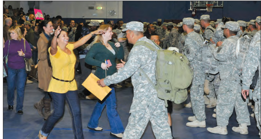
Above and right, family members greet their homecoming Soldiers. Every group is met by post leaders, friends and families.

Bishkek Manus Air Base, Kyrgyzstan, and from there to Germany or Italy, sometimes with a stop-off midway. Finally, after checking in equipment and briefings, the Soldiers take buses back to Caserma Ederle. At each location, a 173rd liaison officer communicates the timetable and status of Italy-based troops' return to the Caserma Ederle staff, who pass the message on.