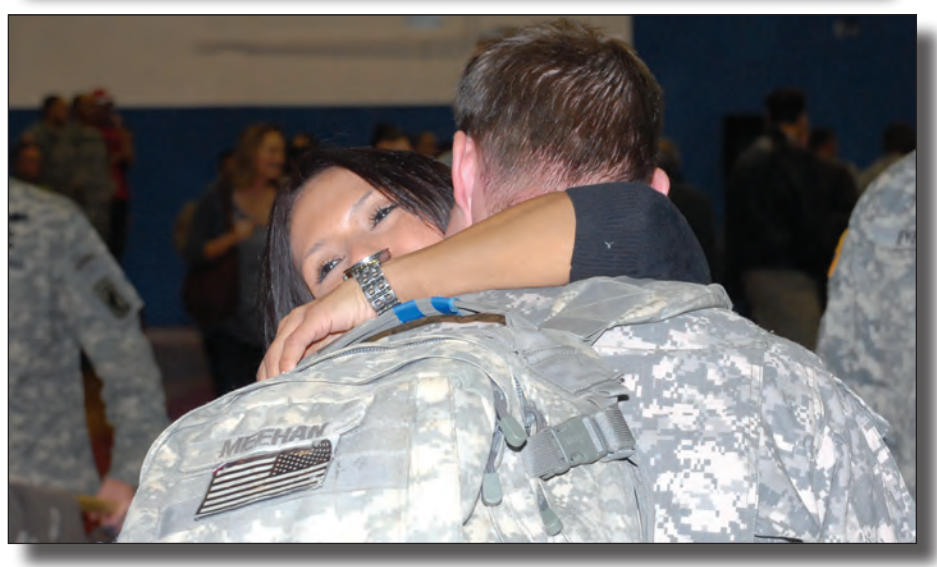
A couple shares a hug Monday afternoon at the Post Fitness Center gym.