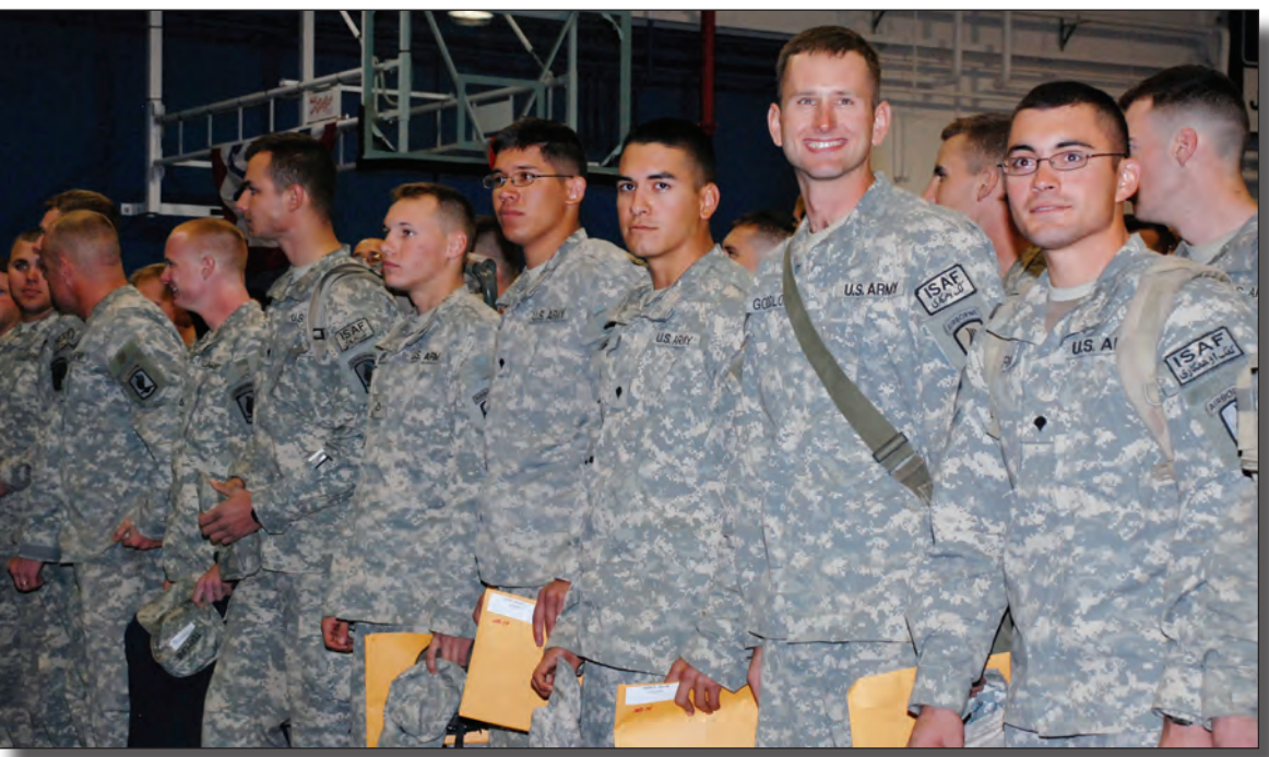
Above, A Soldier grins at loved ones while waiting to be released Friday night.